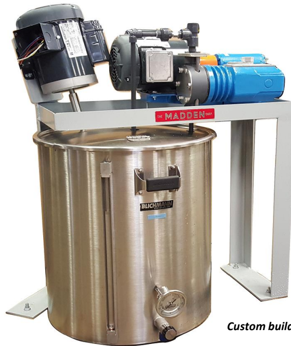
Custom build, chemical feed system

Heavy duty tank and pump systems for practically any chemical addition need.